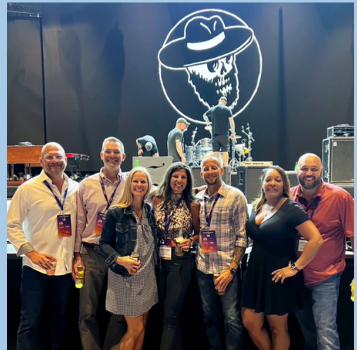
Our Taco Bell Leaders attended the Franmac Convention in Hollywood, Florida.

Here at Southpaw, we love to celebrate all of our employees successes. 'In Your Corner' will be released monthly to update what is going on throughout our regions in our 100+ locations. We are dedicated to building a Southpaw community and celebrating all of our people. We look forward to the monthly stories we get to tell, from our corporate office, and coast to coast in our field locations!