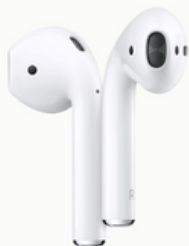
Apple AirPods (2nd Generation) Wireless Earbuds