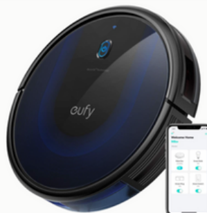
eufy by Anker, BoostIQ RoboVac