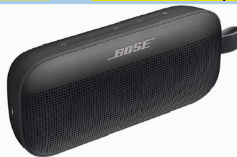
Bose Soundlink Bluetooth Portable Speaker