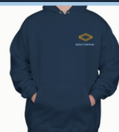
Southpaw Hoodie Sweatshirt