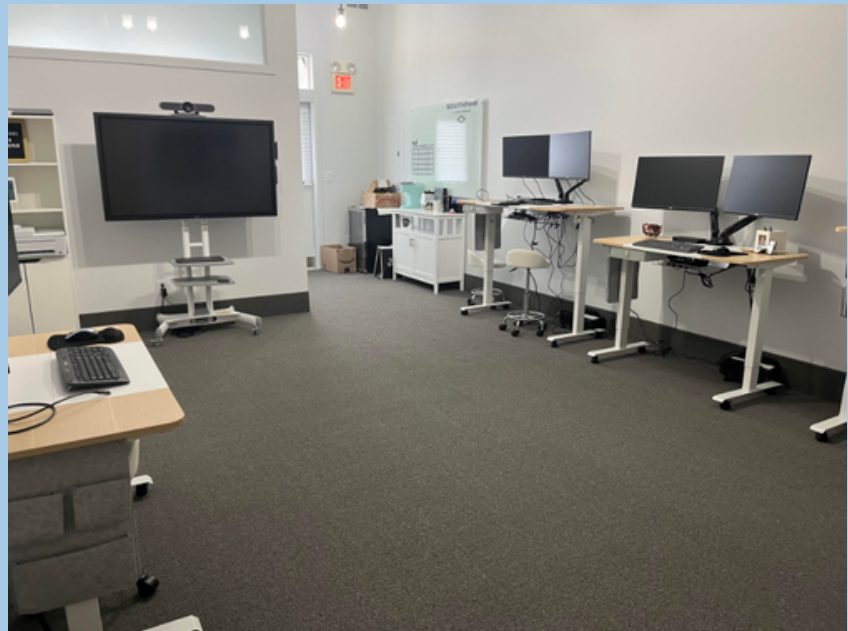
Southpaw's back office is growing!

With many new locations being added, we needed more space for our growing back-office team in Connecticut. The HR & Payroll team LOVE their new space!