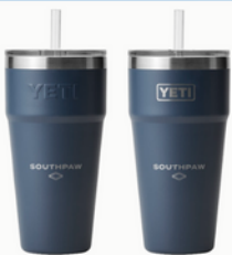
Southpaw Yeti Tumbler